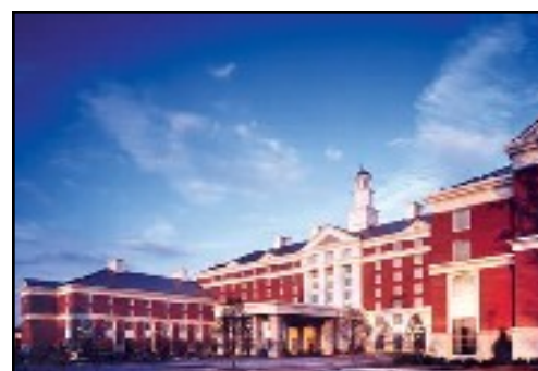
Easton Hilton - home of the best clinic in the USA

It has been an honor to serve as your president the past two years. Please know that your time and effort in coaching our student-athletes is truly appreciated! The OATCCC Executive Board hopes that you will find this year's Clinic educational and motivational