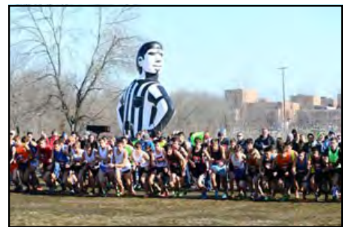
Boys Start Midwest Regional Qualifier

Congratulations to all of you on an outstanding cross country season! You represented yourselves and Ohio well!!