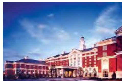
Easton Hilton - home of the best clinic in the USA

This ends my second tenure as president of