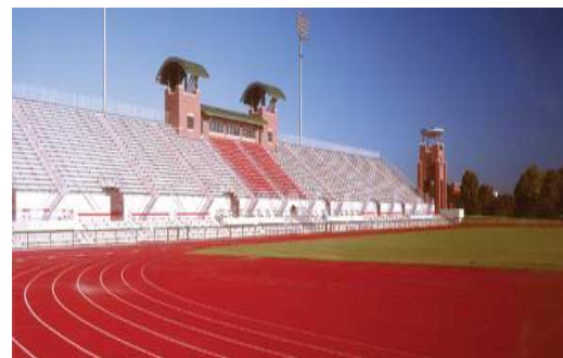
JESSE OWENS STADIUM THE OHIO STATE UNIVERSITY