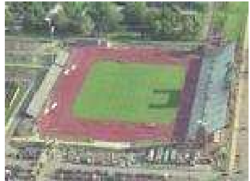
Jesse Owens Memorial Stadium