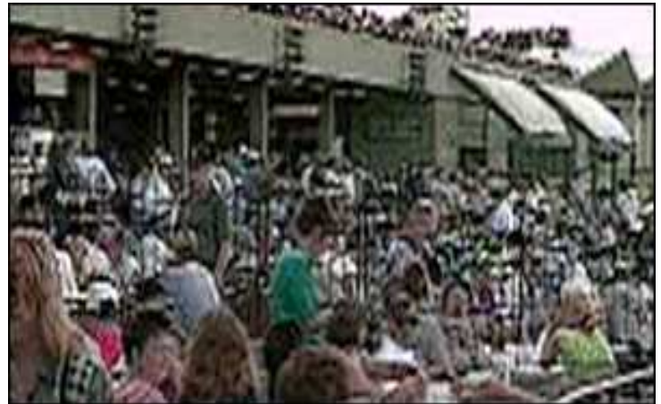
Scioto Downs Raceway