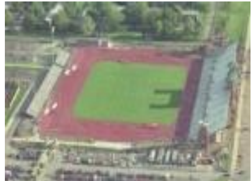
Jesse Owens Memorial Stadium